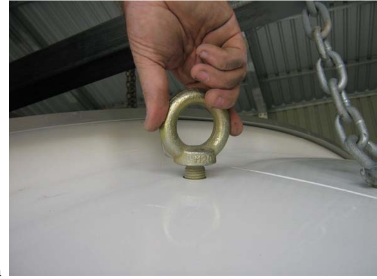
Fig 15a The complete dome assembly should now be able to be completely rotated on the floor and the shutters open and closed.

Using a crane or such lift the dome into the air approx 2.5 m.